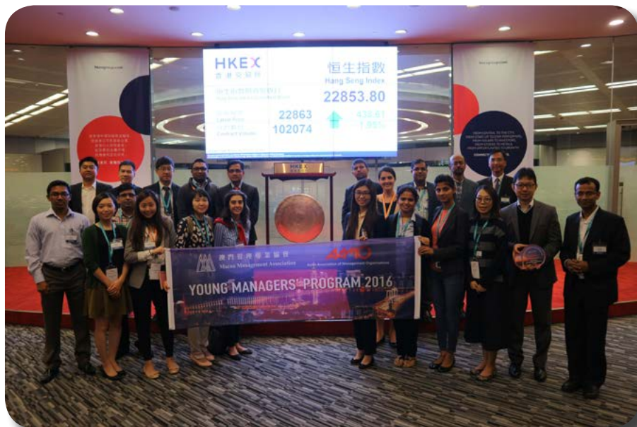
香港交易及結算所有限公司代表與參加者合照留念 Group Photo session between participants and the representative of HKEX